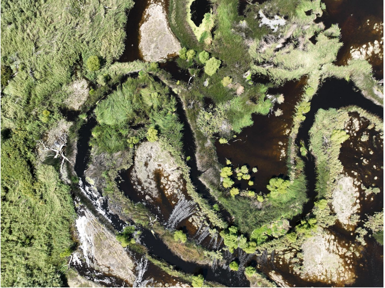
Figure 1. Lower Owens River in Flood (8/29/2023)